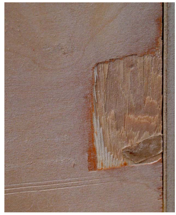
Above: This piece of veneer peeled away when we removed a bit of tape. The plies beneath were not properly laminated.

Often this plywood doesn't even come up to the dimensional standards set by the American Plywood Association for