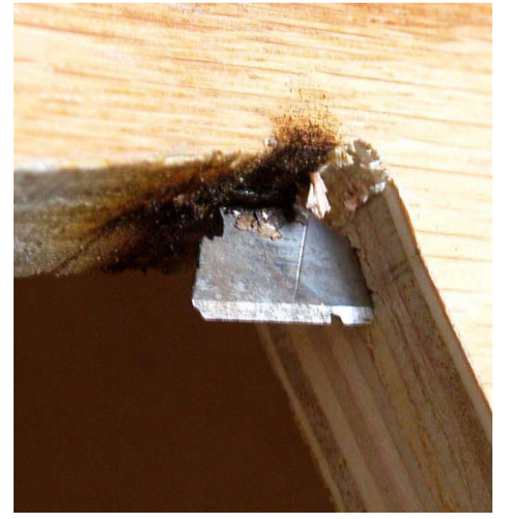
Above: A little surprise hidden between the plies of a piece of Chinese plywood. Below: Uneven plies, overlapping layers, and collapsed voids in the single sheet of plywood we used to make the Clamp Caddy. And this is the norm! At the very bottom is plywood sold by the same retailer for the same price just two years ago.

To say that this Chinese import is inferior to the domestic hardwood plywoods available previously doesn't even begin to describe the gap in quality. The veneer is too thin to do a proper sanding; don't even think about sanding out a blemish. The